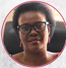
Hon. Margaret Muhanga State Minister for Primary Health Care