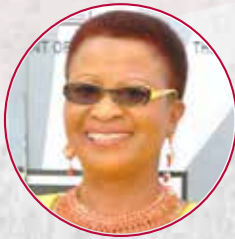
Hon. Hanifa Kawooya State Minister for General Duties.