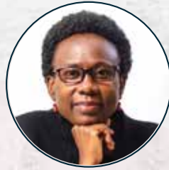
Hon. Dr. Jane Ruth Acheng Ochero Minister of Health/ Conference Host